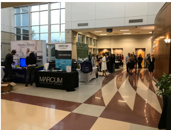
The exhibition hall at Northern Illinois University.